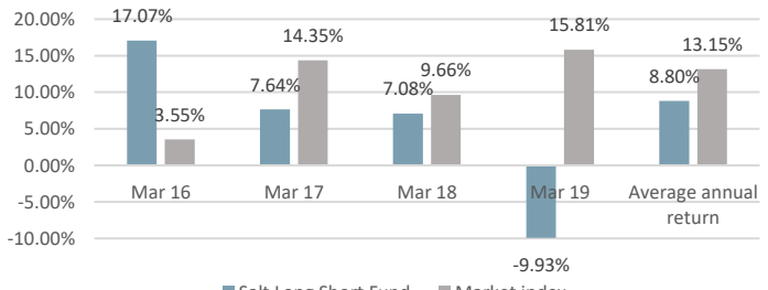
■ Salt Long Short Fund ■ Market index

This shows the return after fund charges and tax for each year ending 31 March since the fund started. The last bar shows the average annual return since the fund started, up to 30 September 2019.